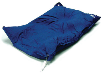
SVRT-7535 SecureVac Cushion