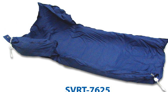
SVRT-7625 T-Vac Cushion

Phone 800.624.6649 • www.BionixRT.com 5154 Enterprise Blvd., Toledo, Ohio 43612