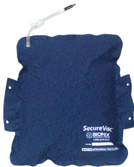
RT-7136 Extremity SecureVac Cushion