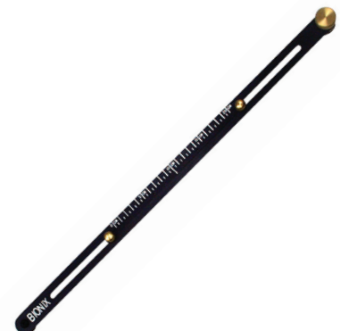
RT-5012A SecureFit™ Bar II Varian Exact

The products you want, the service you deserve.