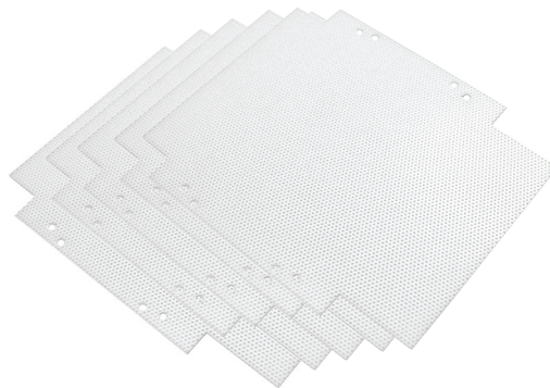
RT-340P Extremity Thermoplastic Sheets